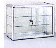
Locking Countertop Aluminum Framed Glass Showcase - Fully Assembled